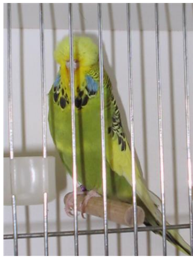
Dom Pied of Tony Pisano YB selection Show 2006