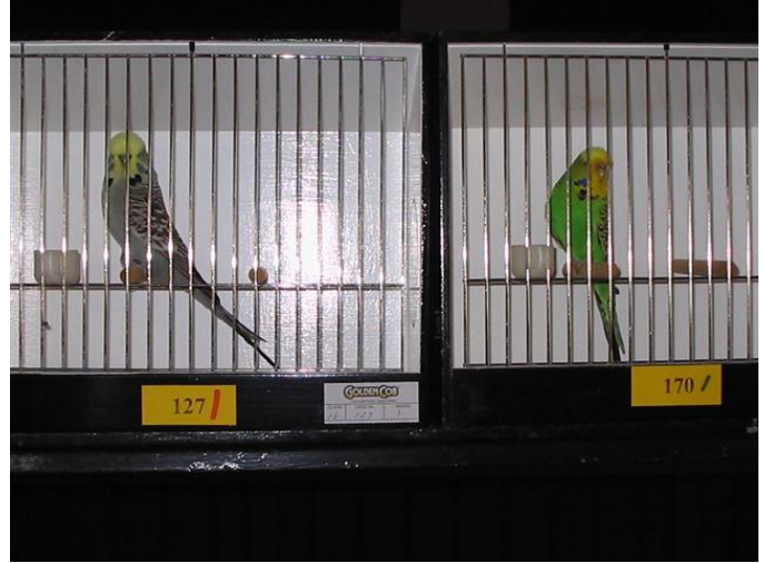
Grand Champ & Opposite Sex