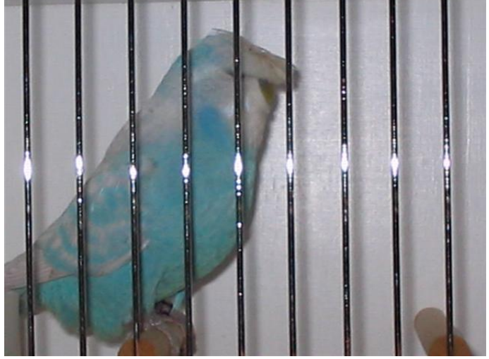
Crested WBC 2006 owner is unknown?