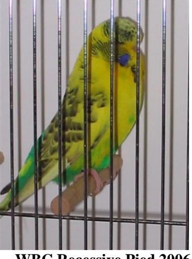
WBC Recessive Pied 2006