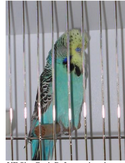
YF Sky Cock B. Lewandowsky