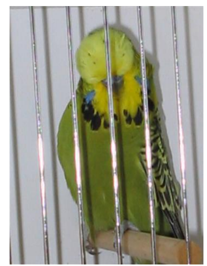
Normal Grey Green Cock of Scott Eriksen