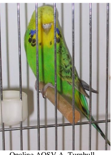
Opaline AOSV A. Turnbull