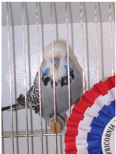
Grand Champion Normal Grey Cock O'Callaghan Family