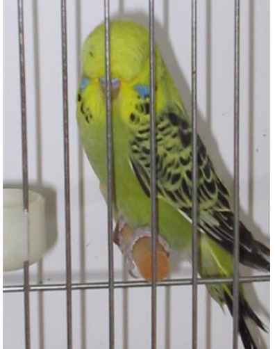
Opaline Grey Green Cock Williams Family